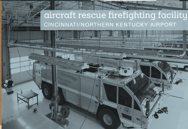
aircraft rescue firefighting facility CINCINNATI/NORTHERN KENTUCKY AIRPORT