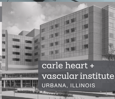
carle heart + vascular institute URBANA, ILLINOIS