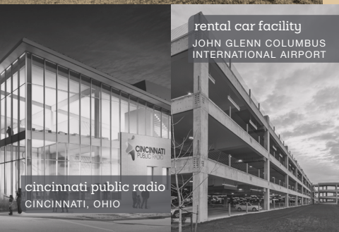
rental car facility JOHN GLENN COLUMBUS INTERNATIONAL AIRPORT