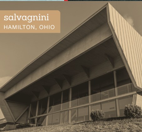
salvagnini HAMILTON, OHIO