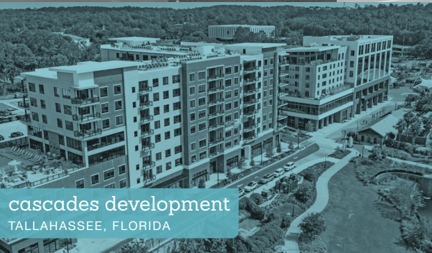
cascades development TALLAHASSEE, FLORIDA