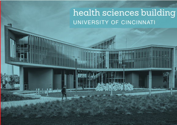
health sciences building UNIVERSITY OF CINCINNATI

DISTRIBUTE EDUCATE ENTERTAIN GATHER HEAL LIVE PARK SHOP STAY WORK