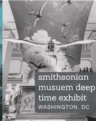
smithsonian museum deep time exhibit WASHINGTON, DC